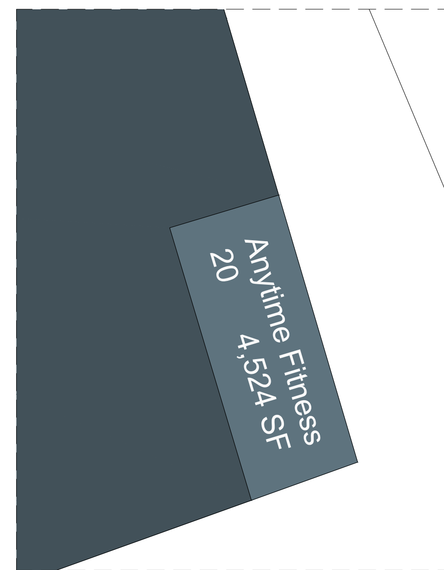
RETAIL 'C' 1"=30'