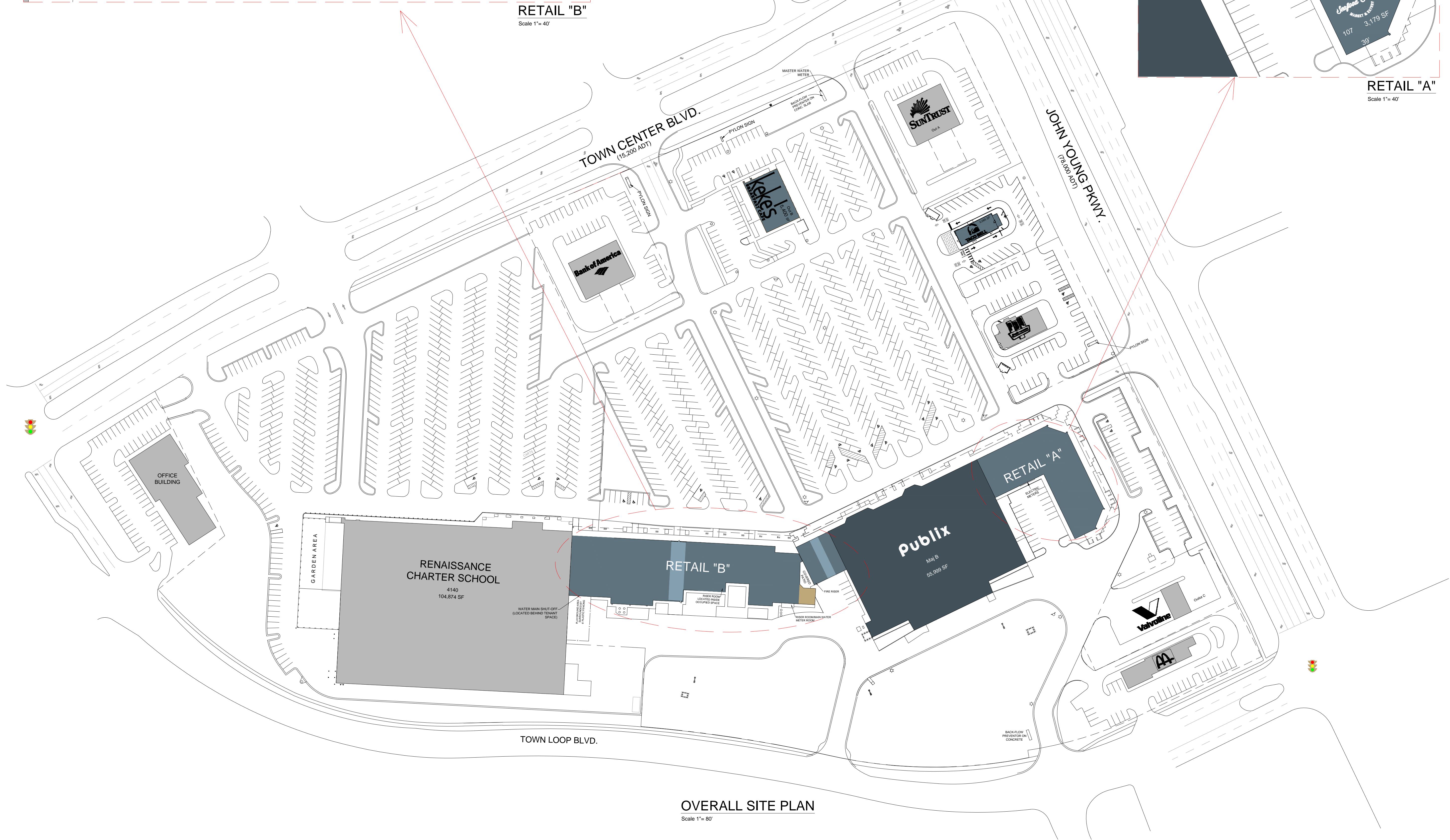
OVERALL SITE PLAN Scale 1"= 80'