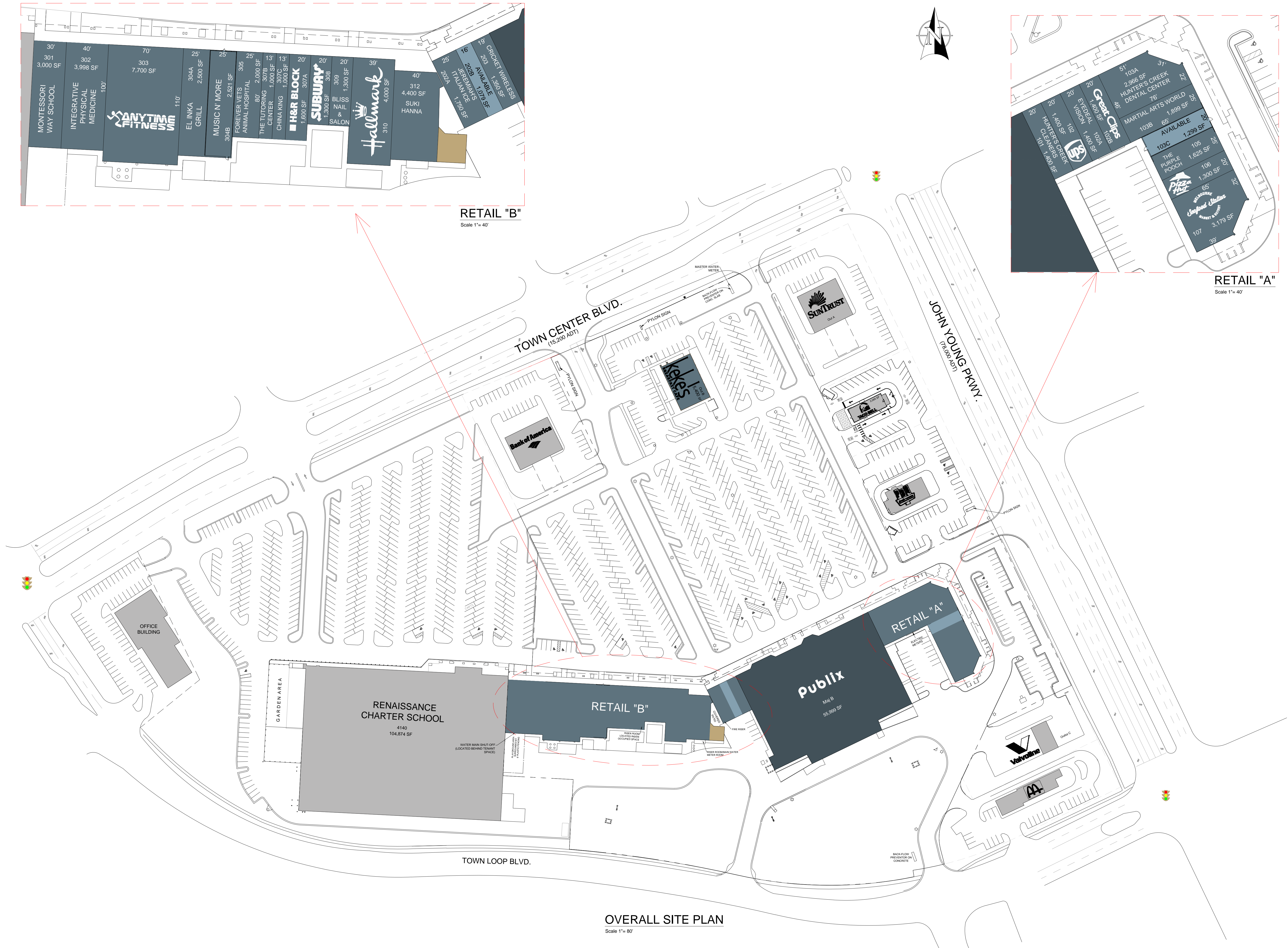
OVERALL SITE PLAN Scale 1"= 80'