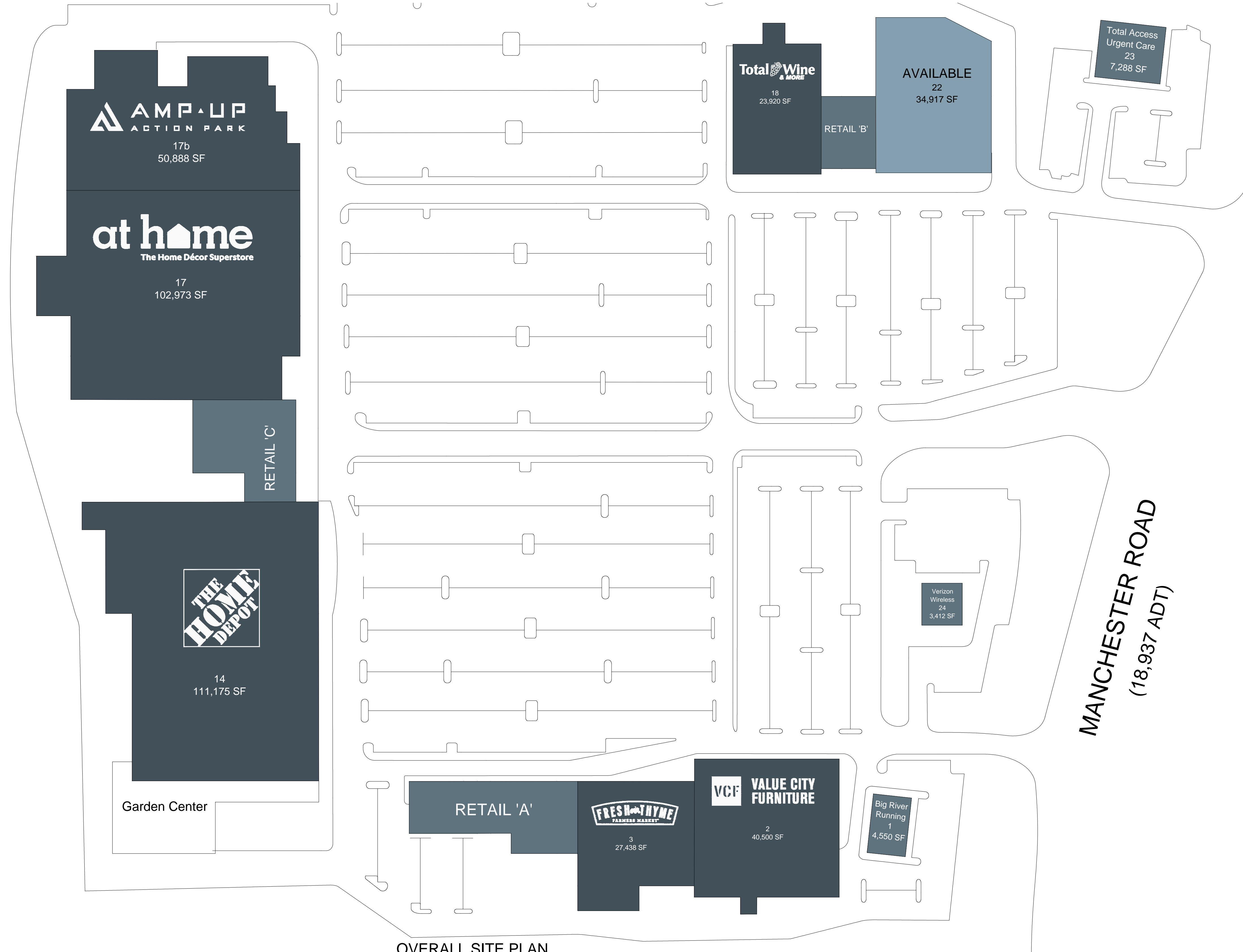
OVERALL SITE PLAN 1" = 100'