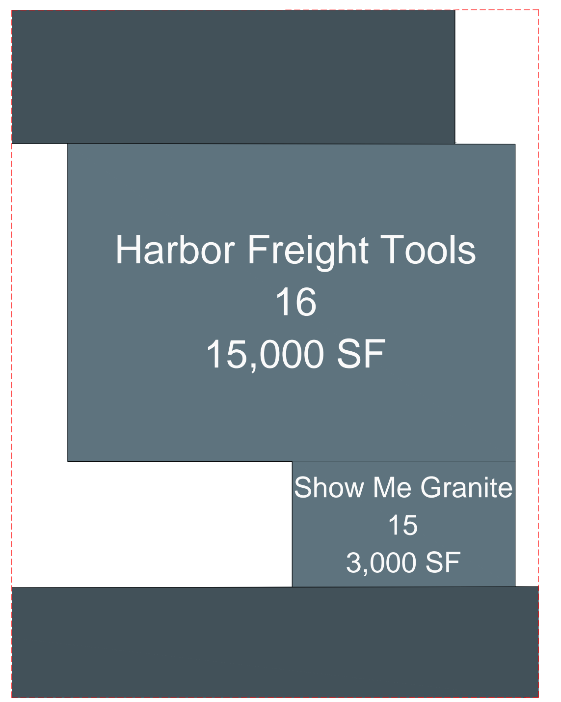
RETAIL 'C' 1" = 40'