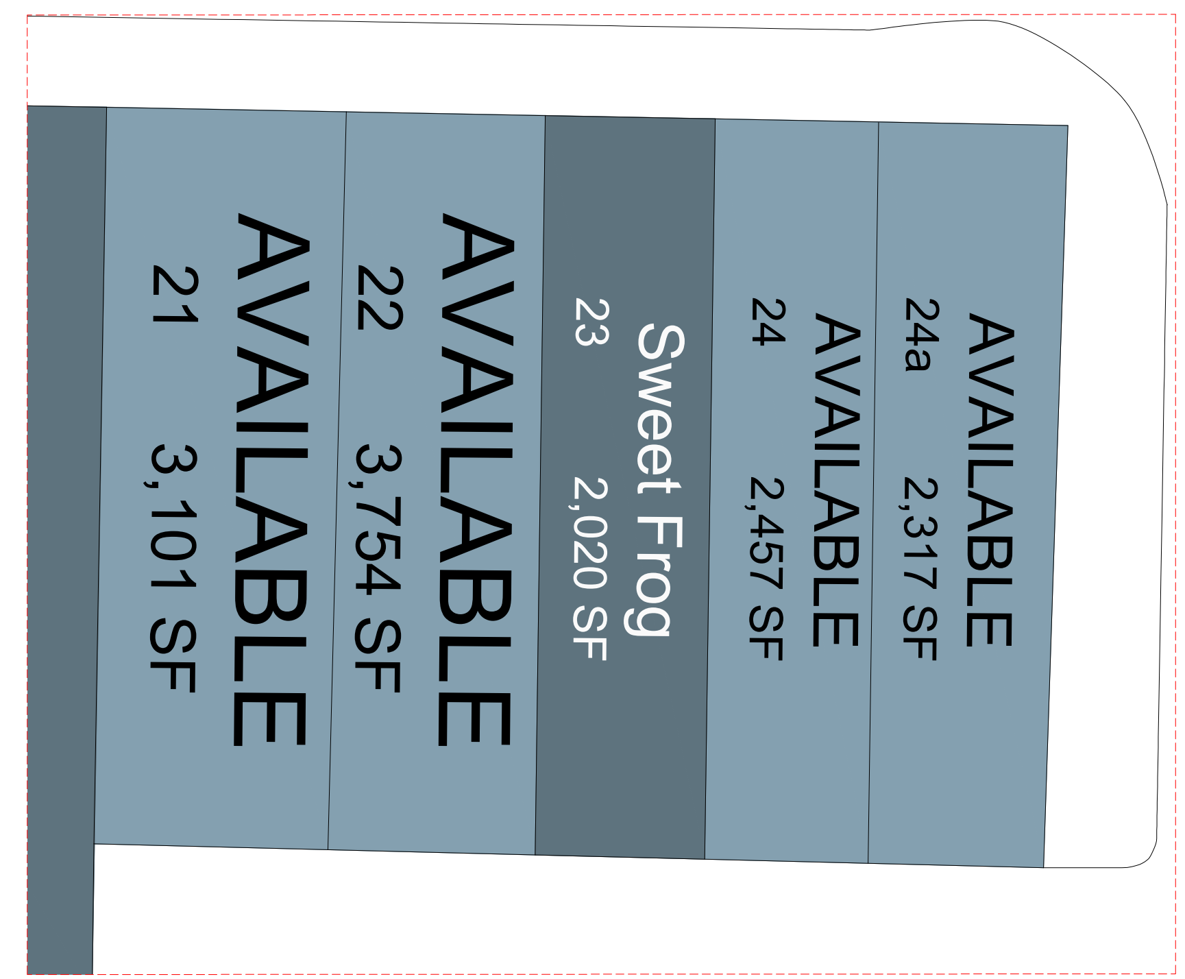
RETAIL "B" 1" = 40'