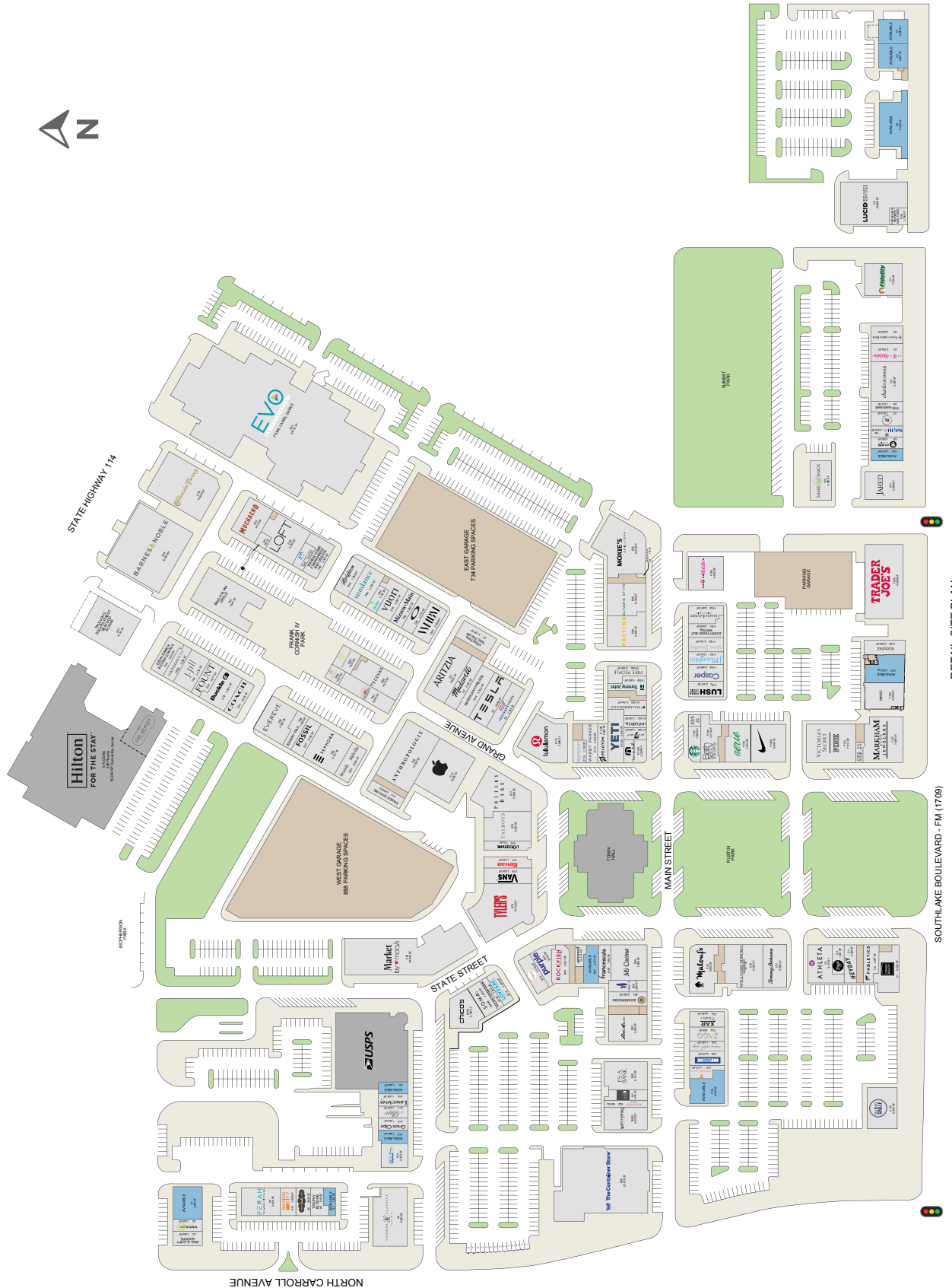
RETAIL SITE PLAN