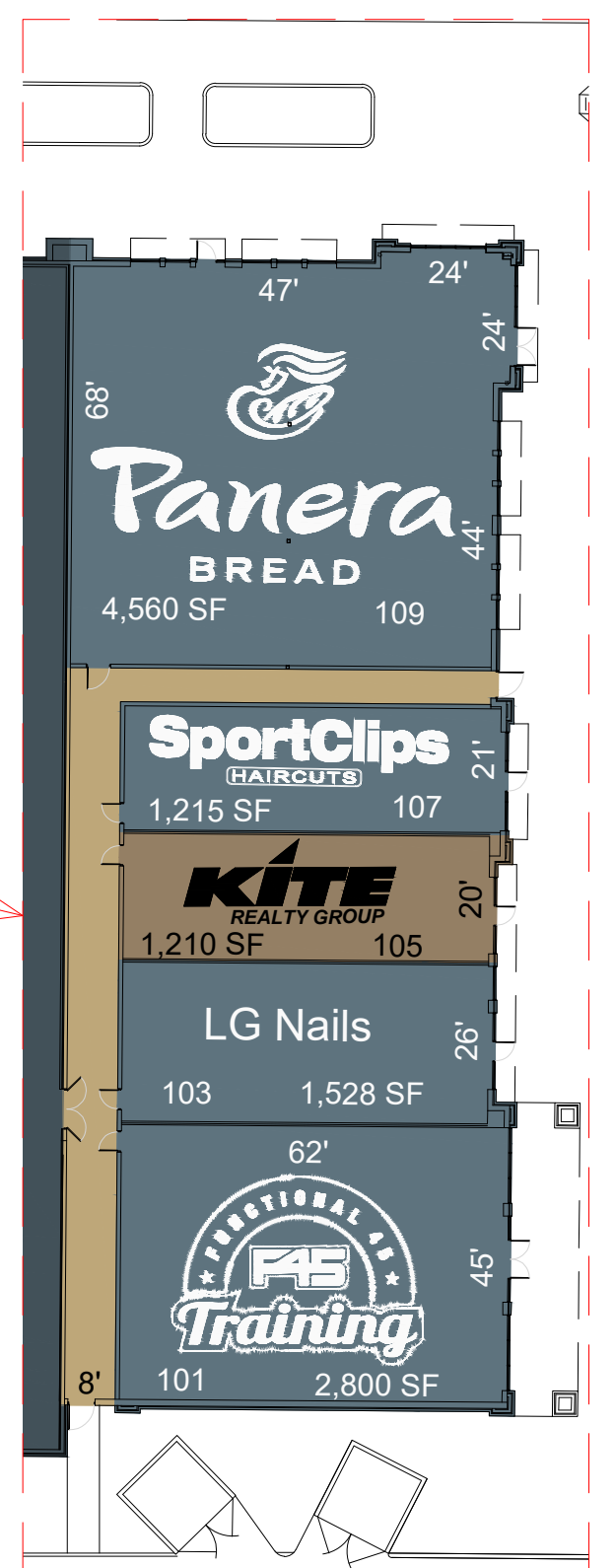
100 Shops SCALE: 1" = 30'