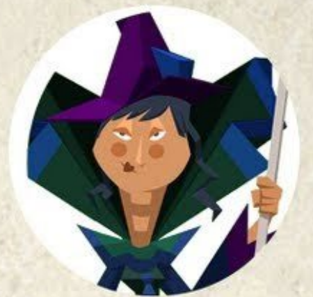
The evil witch, Medea