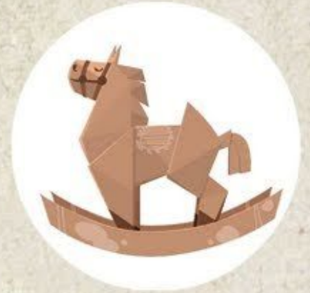
Hoiho, the magic horse