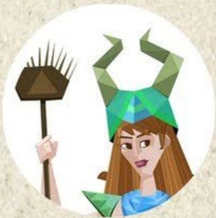
The good witch, Astra