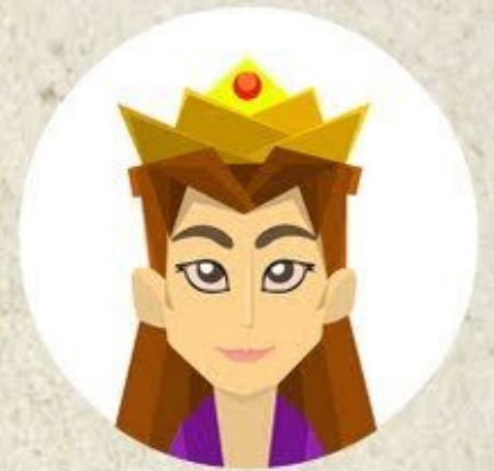
Leisha's mother, The Queen