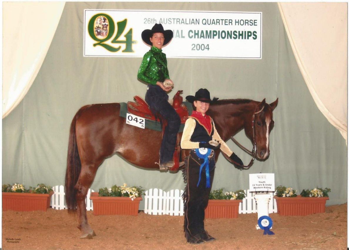
PHOTO: DUAL WESTERN RIDE, 2004