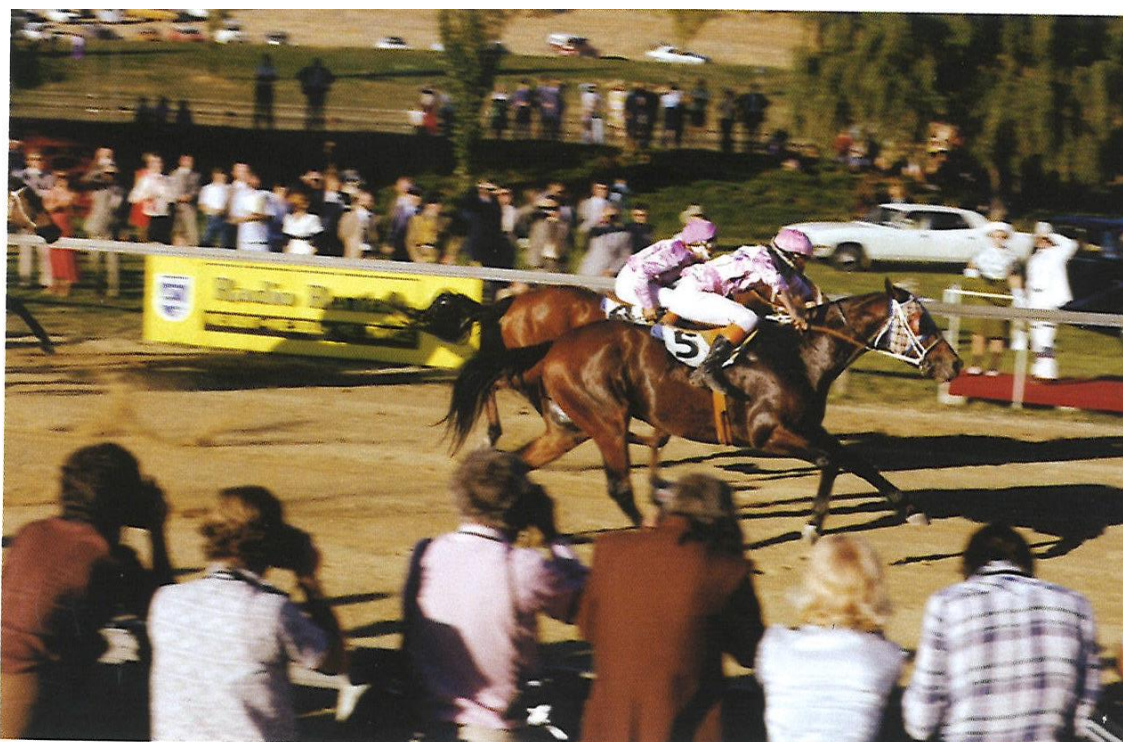
WILLOMURRA FINNIGAN R1-3268 WINS THE JUBILEE SPRINT FROM WILLOMURRA FANTAIL R1-3269 WITH WILLOMURRA ENSIGN P-2278 COMING THIRD.

WILLOMURRA FINNIGAN R1-3268 (out of CHAMBERY FM-03063): - 1976 All Australian Futurity finalist, winner of 40 races, 20 seconds and six thirds and three fourths over distances from 300 to 1,000 meters. Held eight track records and two race records and recorded three official AAA times and one official AAAT. He was the first horse to be awarded his Racing ROM, and has a general performance ROM. Won the Jubilee Sprint in front of Queen Elizabeth II.