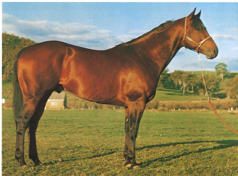
JET MASTER Q-300

As a sire, JET MASTER was very successful, producing 331 progeny, of which 48 were point earners, and produced many successful arena performance horses. In 1978, JET MASTER was named National Sprint Sire of the Year. This award was based on the number of wins gained by a sire's progeny in registered sprint races over the previous twelve months. His progeny had earned 153 points, and the next in line had 61 points awarded to their offspring. He was named the AQHA Leading Sire of Sprint Horses for 1977 and 1978.