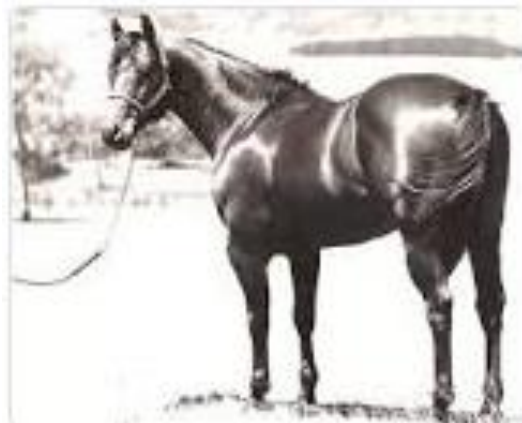
JET MASTER Q-300