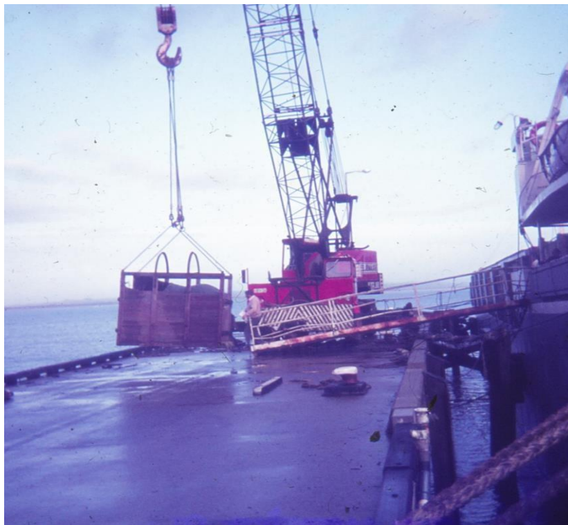
Photo: - BROOMFIELD KINGS BEAM Q-483 making the Bass Strait trip