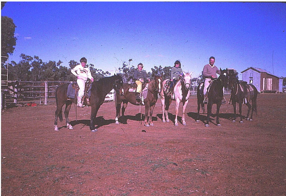
Photo: - 1986 Queensland – station stock on far left and right, chestnut mare in middle an own daughter of Del Mingo, palomino mare Breezy Hollywood/Del Mingo.

QUART POT went on to sire many good working horses in Western Queensland. QUART POT was joined by the next junior sire HANCOCK HOLLYWOOD Q-21892 (purchased from Rita Randall, Miles, Queensland). This bigger liver chestnut stallion with a lot of scope, athletic ability and brains showed a depth of the old established successful cutting/working bloodlines. At 15.3hh, "Rooster", as he was called, improved the overall standards of excellence of the foals and many of the existing broodmares of the twenty-first century Compact Stud go back to him.