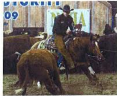
Spins Miss Kitty by Racketeer Cat (imp) from One Moore Spin is the highest selling at Auction daughter at $85,000.