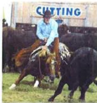
One Moore Senior the highest money earning progeny from One Moore Spin.