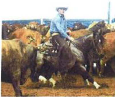
One Roan Peptos with lifetime earnings of $45,883 is another son of One Moore Spin