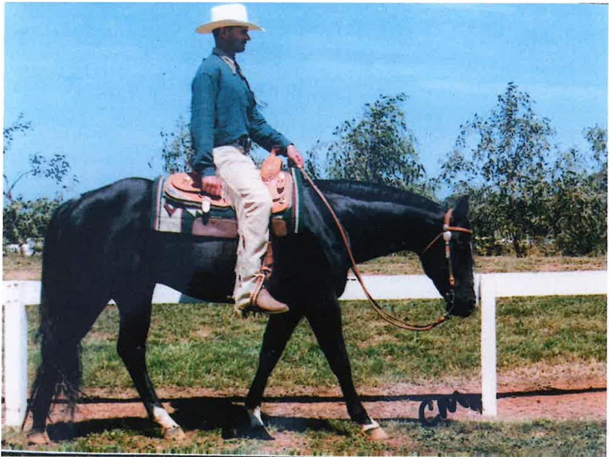
Photo - WESTERN PLEASURE