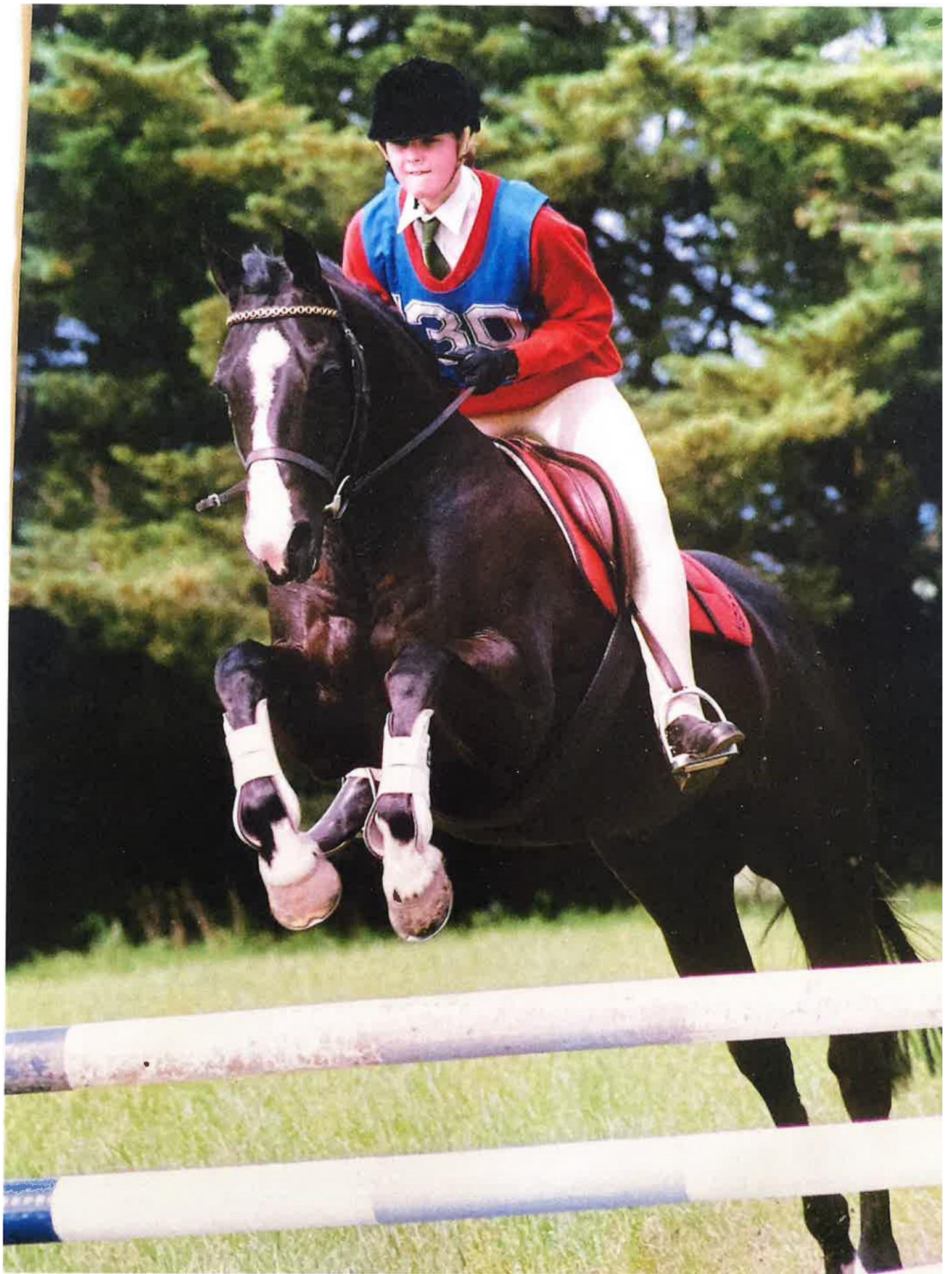
Photo - SHOWJUMPING