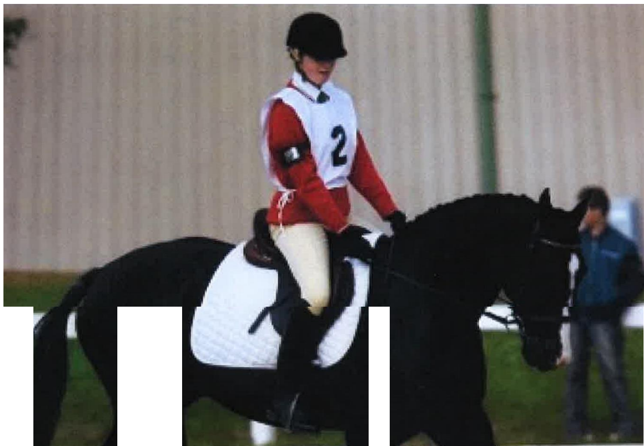
Photo - INTERZONE HORSE TRIALS, WERRIBEE, 2006