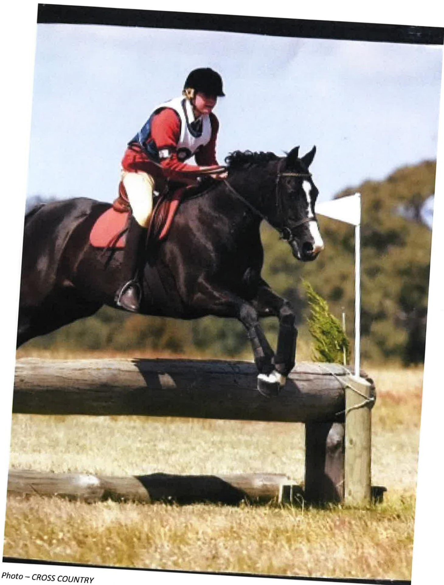
Photo – CROSS COUNTRY