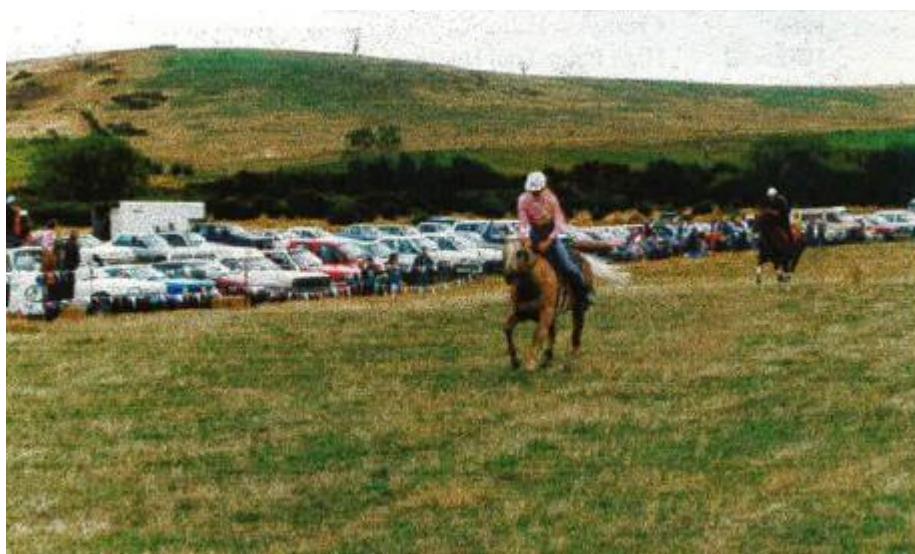
Photo: - Aged 17 – Brambletye Races – Winning the Jillaroo Sprint over 600 metres from 18 starters.