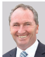
BARNABY JOYCE MP Federal Member for New England

"Please consider sharing in the spirit of Anzac Day and attend one of the services in our area. You can find details for local services in this brochure."