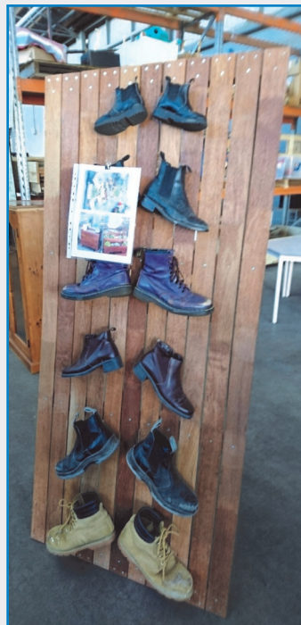
Giving New Life To...

From dog beds and corner seats made from old bed heads, to benches and boxes crafted from pallets ,to upright gardens created with old boots.