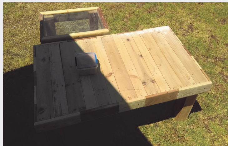
A kids outdoor table made solely from recycled pallets awaits staining.