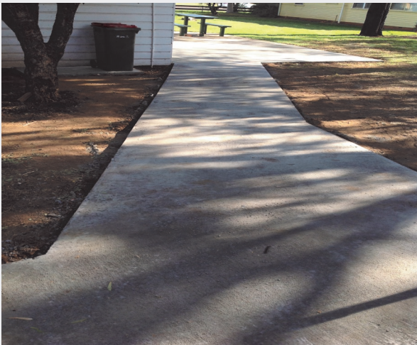
Shared Table Community Kitchen

The WfD activity kicked off in April with the concreting task the first to be targeted and completed. As you can see from the pictures, they've done a pretty good job.