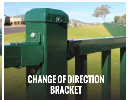
CHANGE OF DIRECTION BRACKET