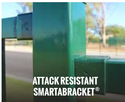
ATTACK RESISTANT SMARTABRACKET®