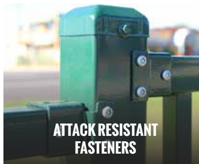
ATTACK RESISTANT FASTENERS