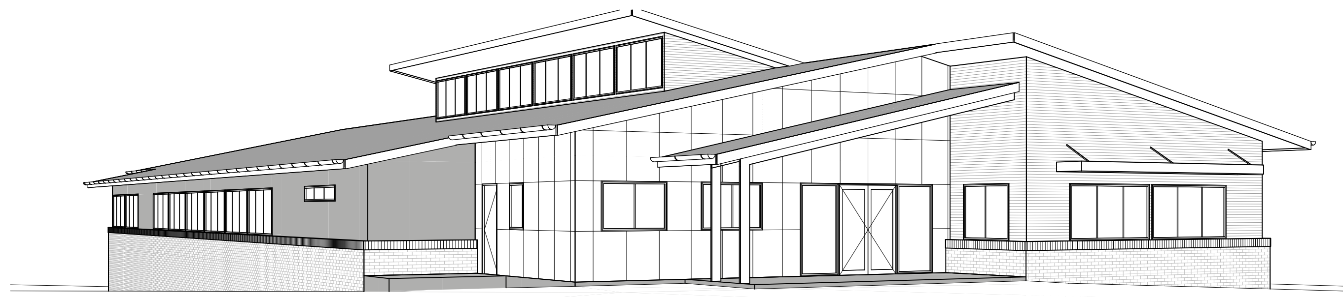
NORTH WEST PERSPECTIVE NOT TO SCALE