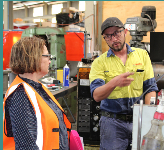
Apollo Engineering (above), and Emergency Warden at Quirindi (below)