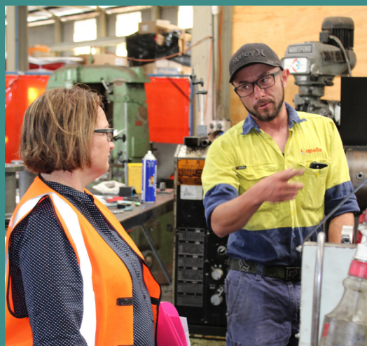
Apollo Engineering (above), and Emergency Warden at Quirindi (below)