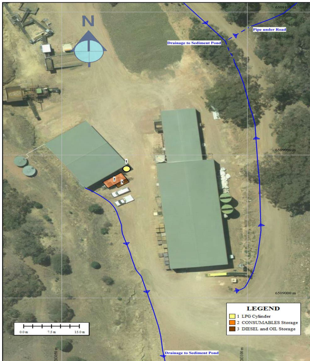
Aerial Photography NOV 2013