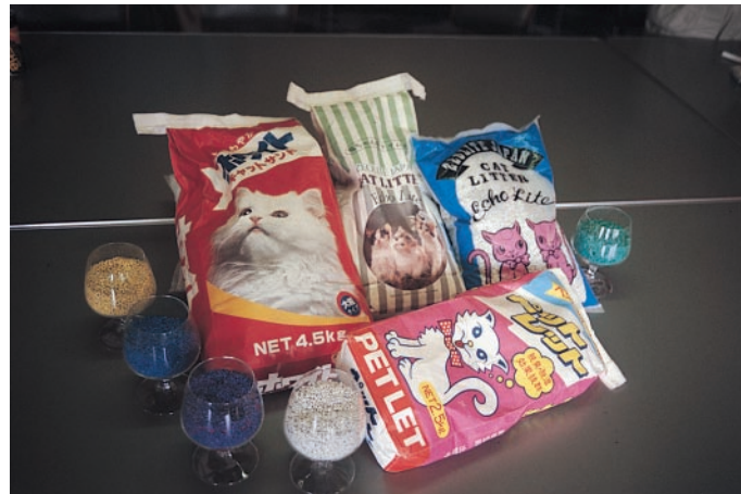
FIG. 8. Zeolite deodorization products from Itaya, Japan [Reproduced with permission from ref. 106 (Copyright 1997, AIMAT)].

ingly soluble phosphate minerals (e.g., apatite; refs. 80 and 81). The small amount of Ca in the soil solution in equilibrium with the apatite exchanges onto the zeolite, thereby disturbing the equilibrium and forcing more Ca into solution. The apatite is ultimately destroyed, releasing P to the solution, and the zeolite gives up its exchanged cations (e.g., K^+ or NH_4^+ ). Taking the zeolite-apatite reaction one step further, the National Aeronautics and Space Administration prepared a substrate consisting of a specially cation-exchanged clinoptilolite and a synthetic apatite containing essential trace nutrients for use as a plant-growth medium in Shuttle flights (Fig. 7). This formulation may well be the preferred substrate for vegetable production aboard all future space missions (82) and in commercial green houses.