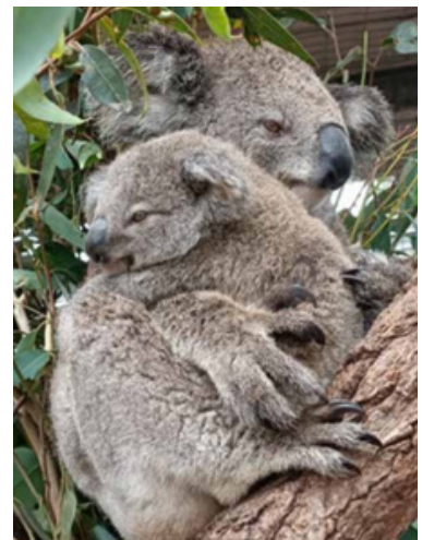
JOEYS STAY CLOSE TO THEIR MOTHER UNTIL THEY ARE BIG ENOUGH TO SURVIVE ON THEIR OWN.