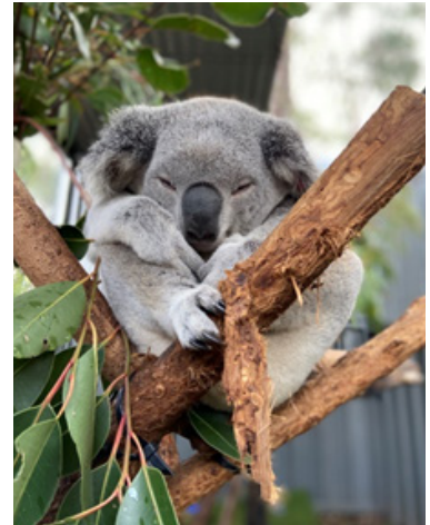
BALLINA FRANKLIN LIKES TO SLEEP DURING THE DAY!

Koalas like to sleep and can sleep for 18 to 20 hours a day.