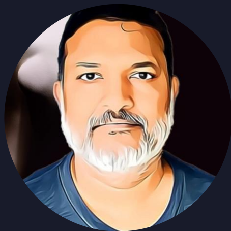
Indran Product Developer