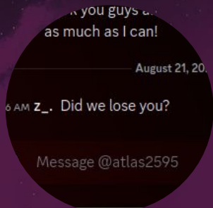
He Fell Asleep