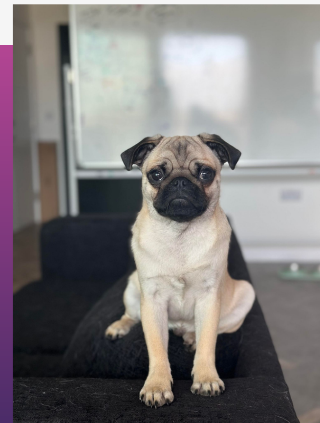
Pugsy Emotional Support