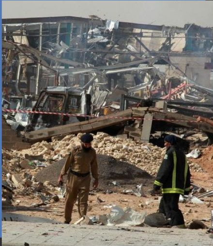
Al Khurais, Riyadh, KSA