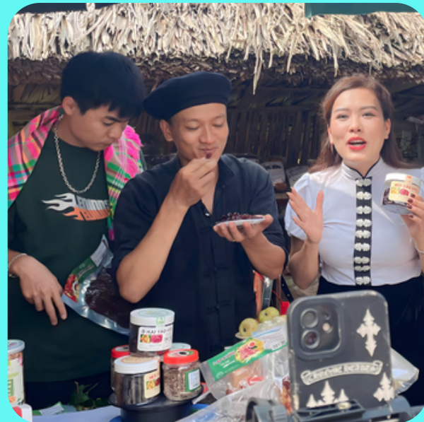
SDG 1: No Poverty