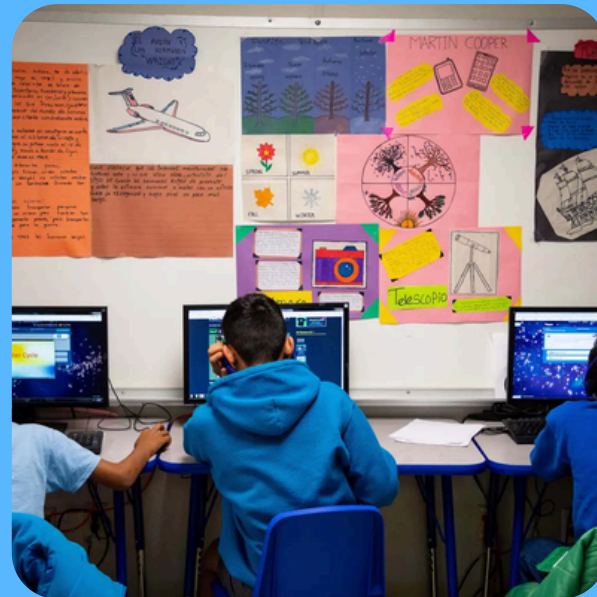
SDG 4: Quality Education