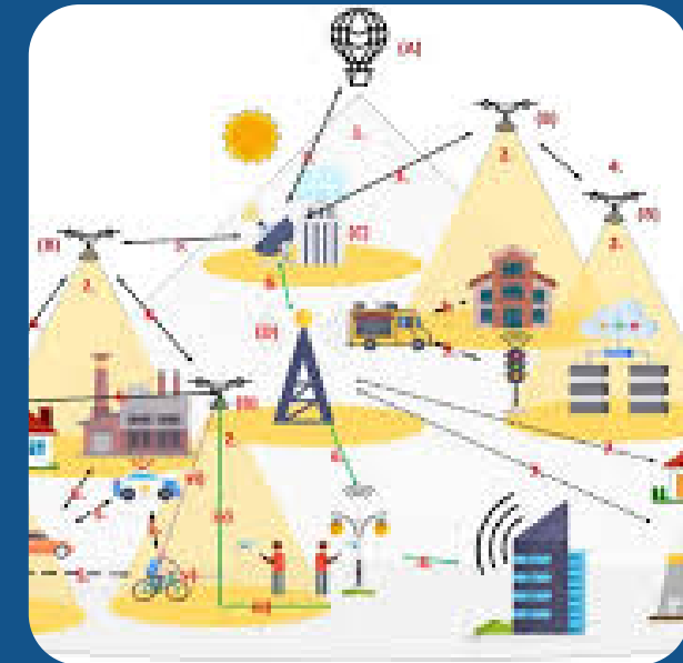
SDG 9: Industry, Innovation, and Infrastructure