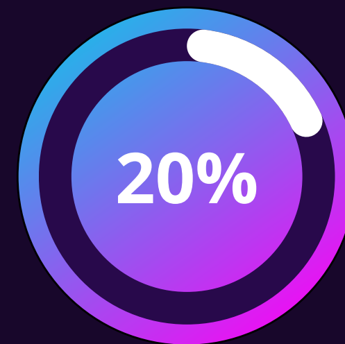
The Recommendation System