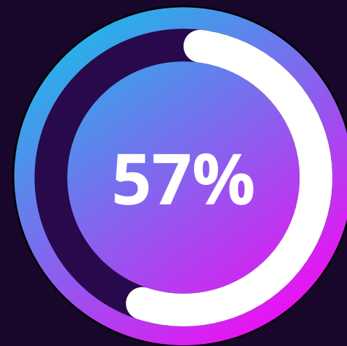
Activity Analysis Model