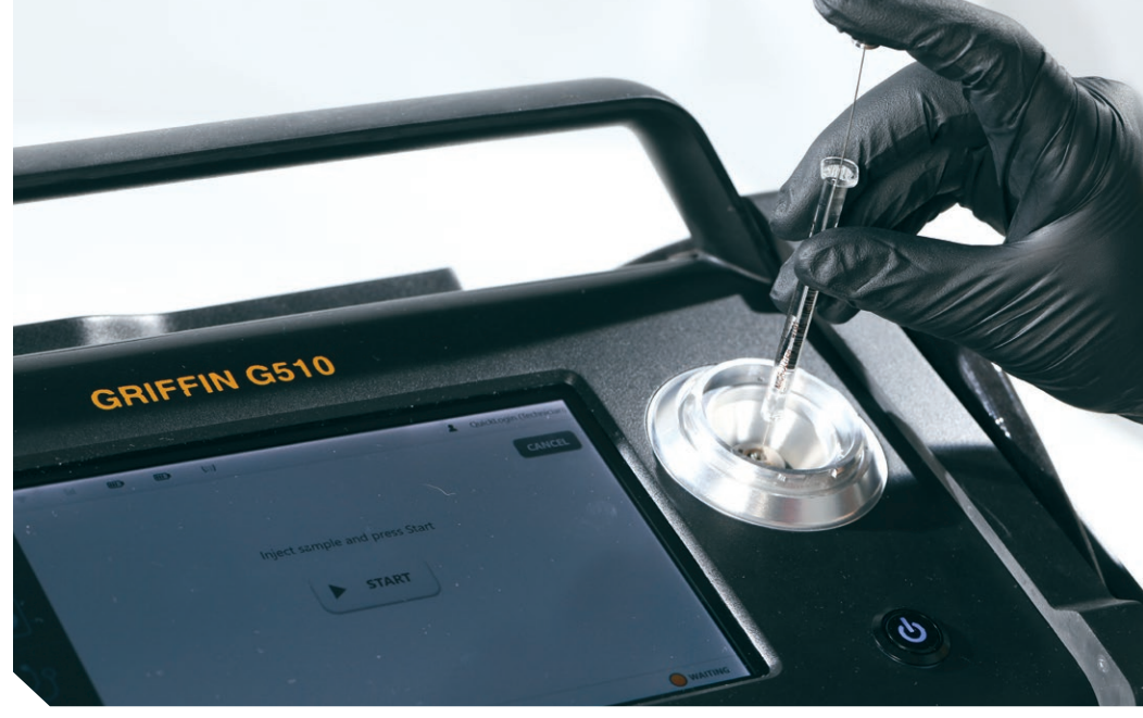
Figure 4 – Syringe injection being performed on the FLIR Griffin G510 portable GC-MS.

Even well after a derailment incident has been resolved, the Griffin G510 GC-MS delivers value. It can be used during remediation missions for subsequent analysis of environmental samples and identification of contamination. Long-term data collection campaigns may involve semi-