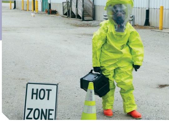
FLIR Griffin G510 Portable GC-MS can be used in the hot-zone while wearing full PPE.

working knowledge of all classes of chemical detection equipment is important because each sensor has a purpose that is tied to an actionable result (Table 1). Additionally, each tool can be used in tandem with other techniques.