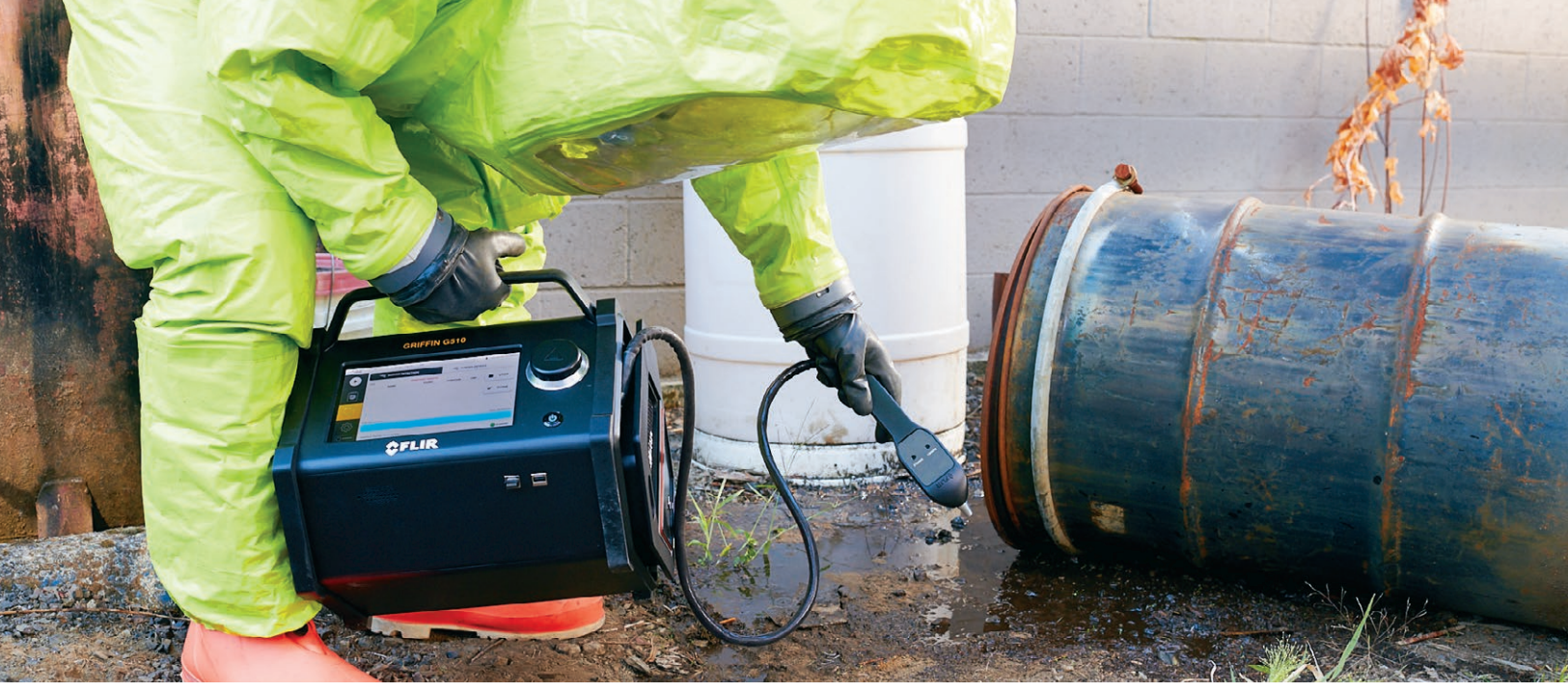
Figure 1 – FLIR Griffin G510 portable GC-MS analyzing a chemical spill in Vapor Survey mode.

chemical warfare agents and toxic industrial chemicals to narcotics.