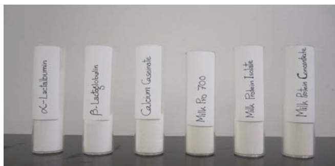
Figure 1. Various milk protein powders

Government regulatory agencies and consumer groups are increasingly demanding that the food industry authenticate all raw materials going into their products. To address such a challenge in a timely and cost-effective manner, product manufacturers usually require an advance sample of food ingredients be shipped to them for testing prior to accepting a large quantity of the commodity. However, once the shipment arrives there is still the question of whether the advance samples were indeed representative of the bulk shipment and there is also a need to confirm that the bulk shipments are uniform in composition. For example, since most dairy powders to the naked eye appear white, with a soft grainy texture and a virtually identical structural consistency (Figure 1), it is necessary to utilize analytical methods to characterize their composition.