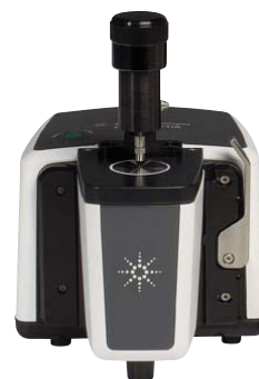
Figure 2. Agilent Cary 630 ATR-FTIR analyzer