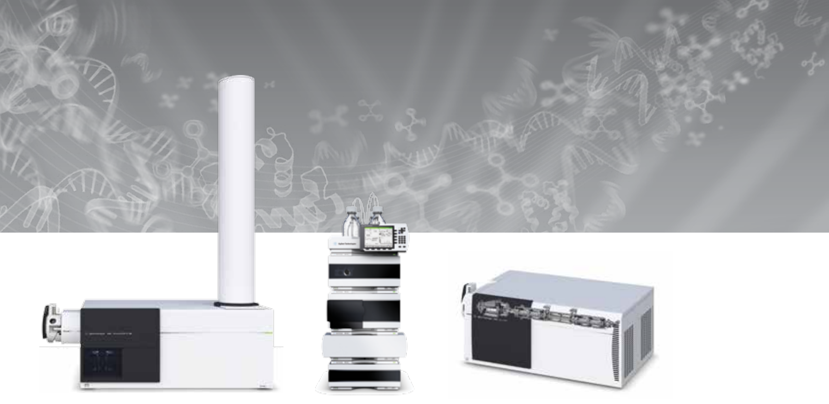
The Agilent 6550 Q-TOF (left), combined with the 1260 HPLC system (center) is the perfect choice for discovery metabolomics, biomarker discovery, and clinical research. The Agilent 6460 Triple Quadrupole mass spectrometer (right) provides ultra-sensitive detection, ideal for quantitation and targeted analysis.