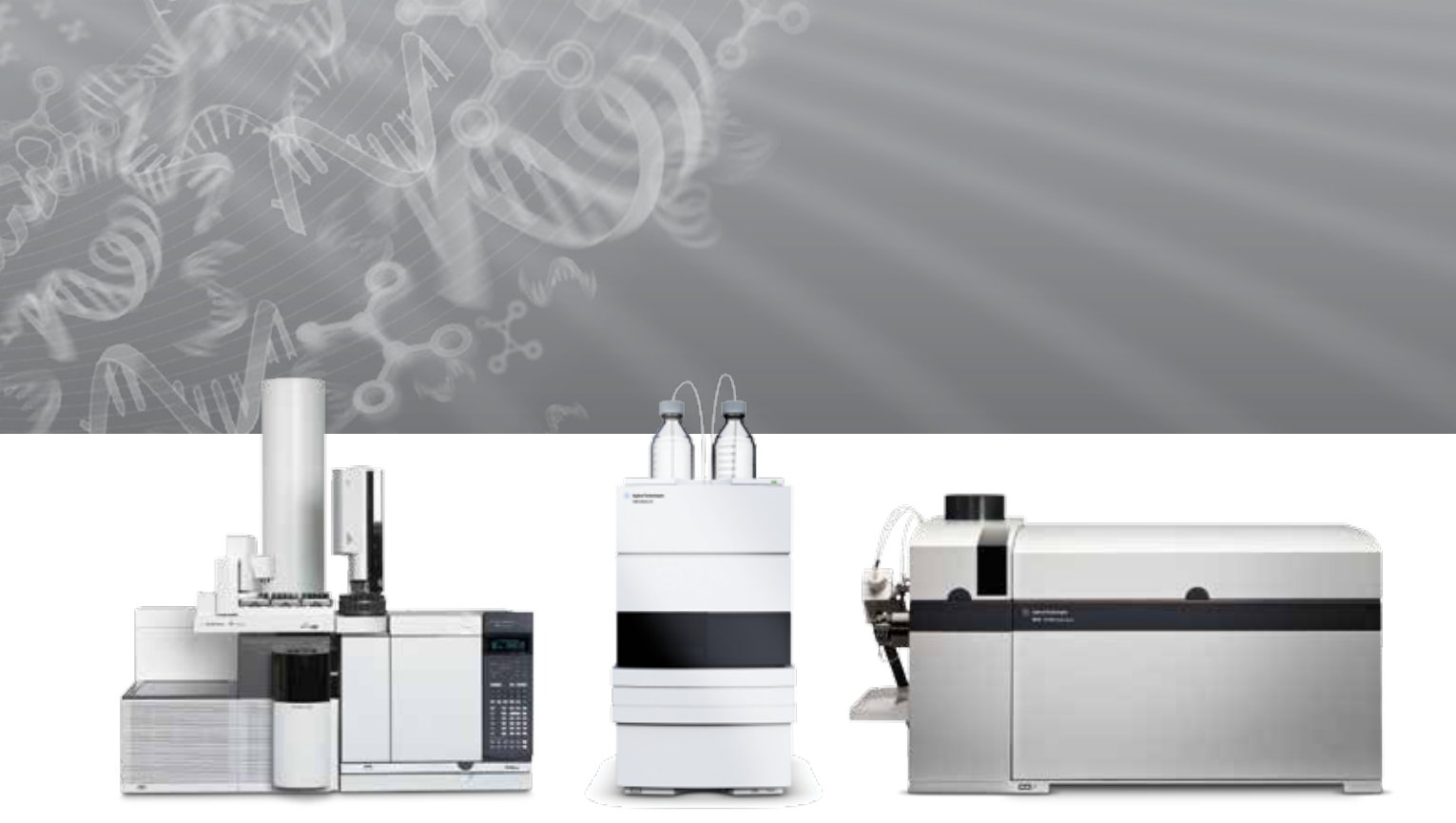
The Agilent 7200 Q-TOF GC/MS system (left) combines unmatched separation power with advanced high-performance accurate mass analysis. It enables you to screen your samples for virtually unlimited numbers of known analytes, or analyze for unknown or emerging contaminants. The Agilent 8800 Triple Quadrupole ICP-MS (right), combined with our 1200 Infinity Series LC (center), delivers accurate and sensitive mass detection. It is especially well-suited for trace level analysis from complex sample matrices.