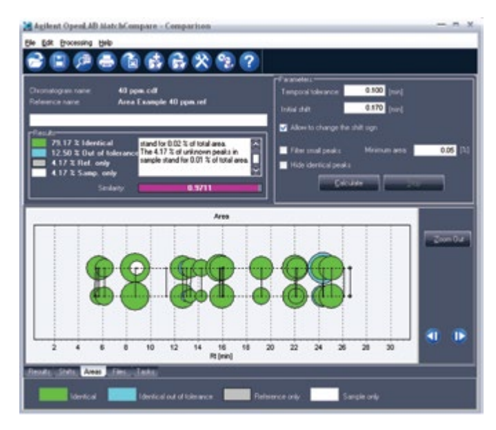
OpenLAB Match Compare's graphical comparison permits quick screening of overall chromatogram match and allows the user to quickly visualize differences.

A powerful and intelligent algorithm allows OpenLAB CDS Match Compare to handle peak distortions, scaling, retention time shifts, and changes in experimental conditions. Using just a single reference chromatogram, samples are quickly and easily compared for quality assurance, reducing the need for frequent reference sample reinjections.