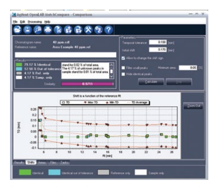
OpenLAB Match Compare shift analysis screen permits easy evaluation of chromatographic shifts.

With OpenLAB CDS Match Compare, user-defined area percent tolerance limits are identified for each peak of the reference chromatogram and area percent comparisons are reported for each matched peak. These area percent comparisons are checked against user-defined limits and a color-coded report is generated for easy identification of pass/failed peaks.