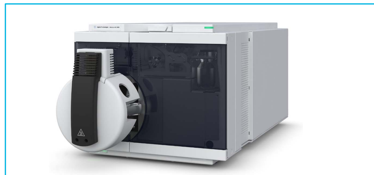
Figure 1. Agilent Ultivo TQ.