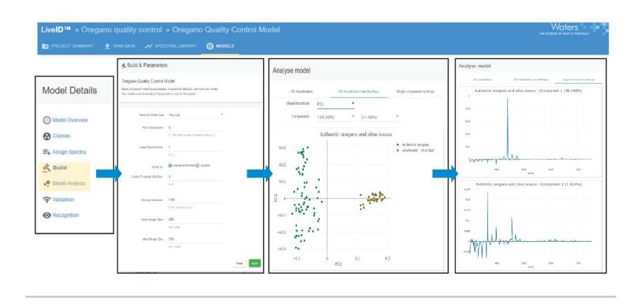
Figure 3. LiveID oregano model optimized parameters, PCA model 2D scores plot and single component loadings plots for PC 1 and 2.

As the most diagnostic spectral range was found to be between m/z 300–750 this range was used for the subsequent model training and validation phases. A PCA/LDA model was generated whereby the supervised algorithm, Linear Discriminant Analysis, was subsequently applied to the PCA model. Three principal components were retained explaining more than 96% of the total variance in the data. One linear discriminant was applied to the reduced data set. An outlier distance of three standard deviations (97% confidence interval) was defined around the classes combining both scores and residual distances from the class centroid.