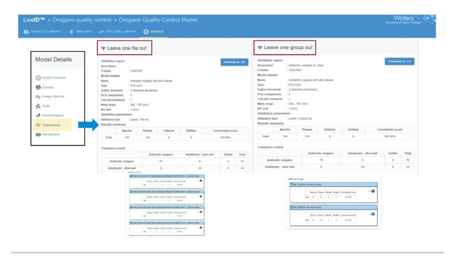
Figure 4. LiveID cross validation results for the oregano model according to the "leave one file out" and "leave one group out" modes.