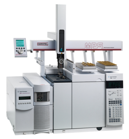
Figure 2: - Analytical solution for Headspace SDME analysis.