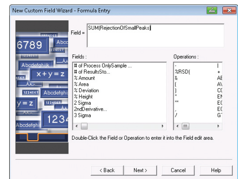
Figure 1. The Empower 3 Software wizard assists you in creating custom calculations.

Figure 2. With Empower 3 Software, you do not need to export data to other programs for custom calculations.