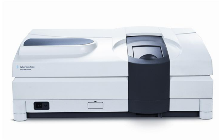
Cary 4000, 5000 and 6000i instruments provide a wide linear dynamic range

Photometric linearity affects how accurately an instrument measures absorbance with increasing optical density or concentration. Poor photometric linearity will produce incorrect results and cause calibrations to become non-linear. The 'addition of filters' technique provides a simple and inexpensive means of demonstrating the photometric linearity and range of most spectrophotometers without the need for standards. This test demonstrates photometric range and linearity of the New Generation Cary 4000/5000/6000i spectrophotometers at high absorbance levels. Routine, or high precision, linearity tests should be performed using the Linear Neutral Density Kit part number 9910056100.