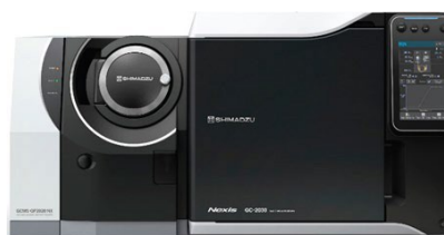
Figure 1: Shimadzu GCMS-QP2020 NX

In the study, an EST Analytical Econ Evolution purge and trap concentrator and Centurion WS autosampler were interfaced to the Shimadzu GCMS-QP2020 NX (Figure 1).