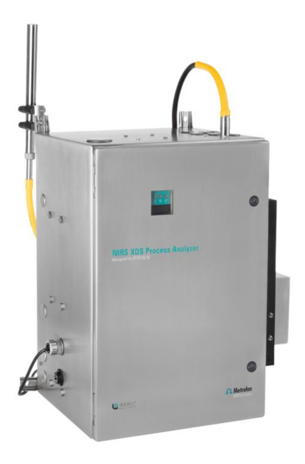
Figure 2. NIRS XDS Process Analyzer from Metrohm Process Analytics.

Wavelength range used: 1100–1650 nm. Inline analysis is possible using a micro interactance reflectance probe with purge on collection tip directly in the fluid bed dryer.