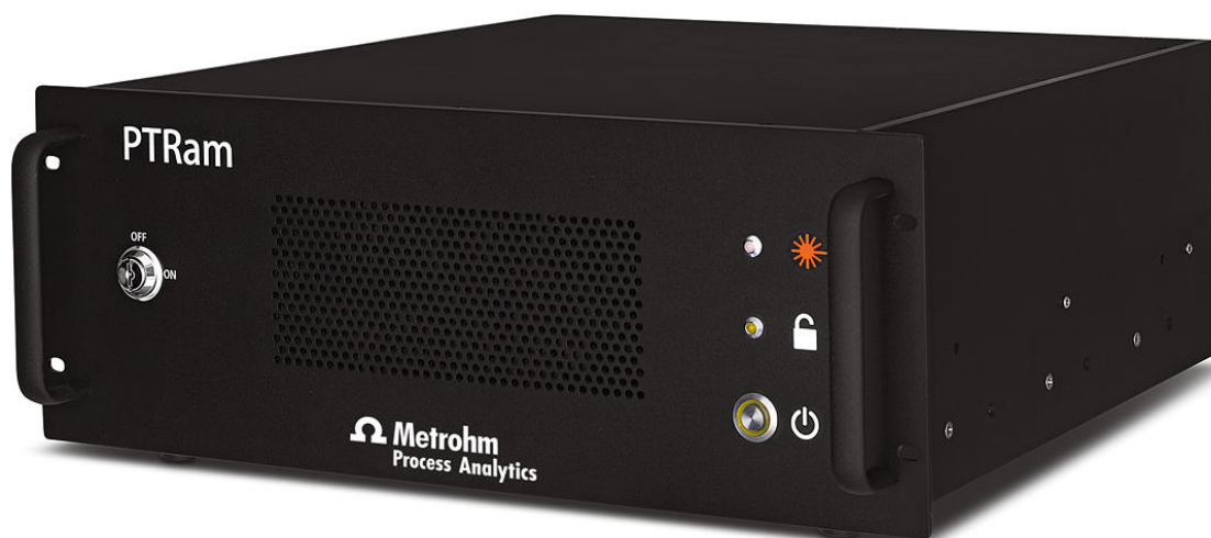
Figure 1. The PTRam Analyzer from Metrohm Process Analytics.

There is minimal space available to install an analysis system within the wet bench area (Figure 2a). Therefore, the PTRam Analyzer is the ideal solution for restricted spaces due to its small dimensions. Thanks to the embedded IMPACT software and the variety of industrial communication protocols, results can be