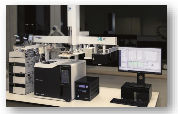
Figure 1: LC-GC online system

The LC is directly connected to two high temperature GC columns with retention gaps which are installed in one GC oven. MOSH and MOAH fractions are separated on a silica gel programme is started and both fractions are separated simultaneously and detected by FID. Figure 1 shows a typical LC-GC online system based on the Shimadzu LC-20AD solvent delivery pumps, the GC-2030 gas chromatograph and the LC-GC Chronect Interface by Axel Semrau.