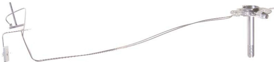
EZ Twist Top™ Shell Weldment for Agilent 7890 GCs

For an educational video on our EZ Twist Top injection port system, go to www.restek.com .