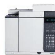
Agilent 7890B GC