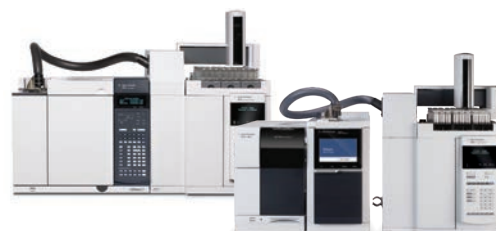
Agilent 7890B GC and 7697A Headspace