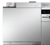
Agilent 7820A GC