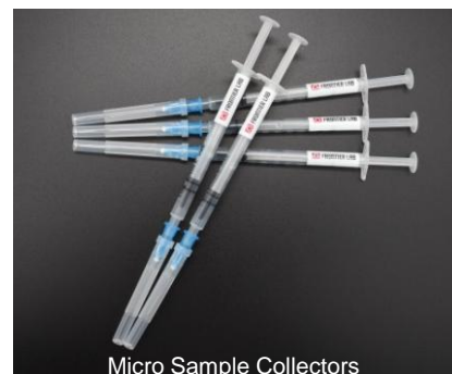
Micro Sample Collectors

The micro coil is disposable, but depending on analytical purposes it can be reused by cleaning with a solvent.