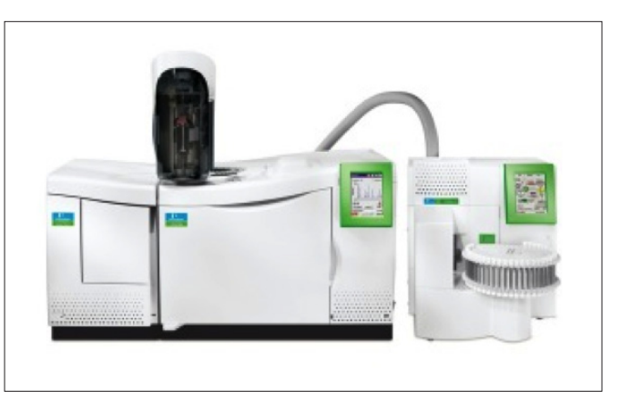
Figure 2. The automated thermal desorption system and Clarus GC/MS used in the collaboration.

These new tubes are designed to fit onto the PerkinElmer TurboMatrix 650 ATD automatic thermal desorber. This instrument features a two-stage thermal desorption process that concentrates analytes before they are introduced into the PerkinElmer Clarus SQ8 GC-MS system<sup>4</sup>. TurboMatrix thermal desorbers provide hightemperature desorption capability that allow the determination of analytes up to C44 hydrocarbons. The automatic addition of internal standard calibration mixtures into the tube before sampling and analysis helps to ensure sample integrity and improves analytical quantification and accuracy. To minimize water vapor entering the system, which can quench target response in MS detection, the system offers optimized dry purging of both the tube and the trap, ensuring efficient water elimination even for high moisture air samples. The system is shown in Figure 2.