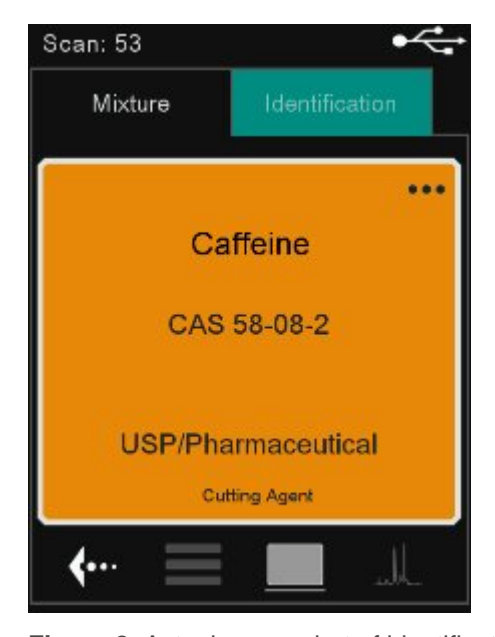
Figure 2. Actual screenshot of identification of caffeine in Yaba with MIRA DS. Caffeine is a chemical commonly associated with illicit drugs. The yellow warning background provides immediate, actionable information about the nature of the sample.