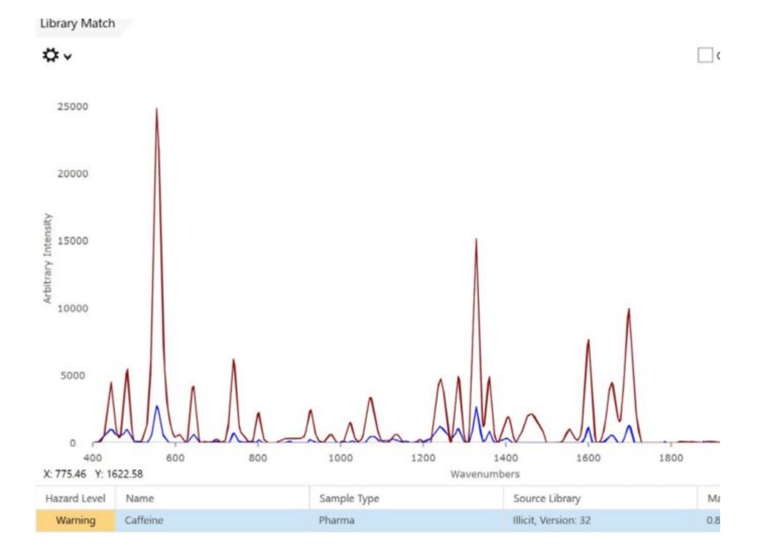
Figure 1. Yaba sample (blue) matched to caffeine (red) in the Illicit Library in Mira Cal DS.