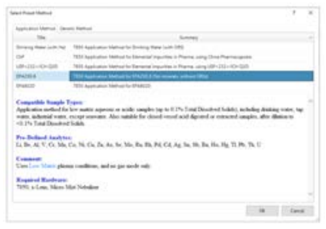
Figure 1 Details of 7850 preset method for drinking water by EPA 200.8. An equivalent method is also provided with the 7900 software.

Agilent 7850/7900 ICP-MS include fully developed methods for regulated and routine methods to save you weeks of method development and documentation time. Preset Methods for EPA 200.8, EPA 6020A, and Drinking Water (with He cell mode) predefine all the required operating parameters.