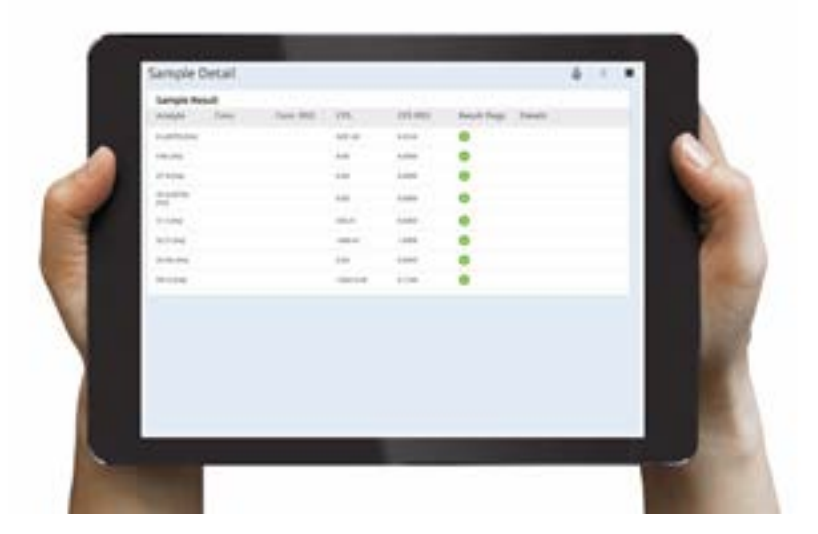
Figure 3 ICP Go is a simple, browser-based interface that allows users to quickly set up and run sample batches from stored templates. ICP Go also supports remote setup and monitoring of your instrument analysis from any PC or tablet via a network connection.

{\hbox{ICP Go}} is included with 7850 ICP-MS Analyzer bundles, or can be purchased separately as an option for ICP-MS MassHunter.