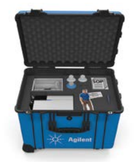
Figure 2 A complete Agilent 7850 ICP-MS based Water Analyzer package is available as a bundle, providing a turnkey solution for water labs in the US and some European countries.